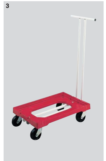
3 Ref. 910A8 As dolly ref. 91005, with handle Dim.: L 604 X w 402 X h 965 mm Dim.: L 23.8 X w 15.8 X h 38.0" four swivel castors, Ø 100 mm/4" Wt: 8.90 kg/19.6 lbs. Colour: red.