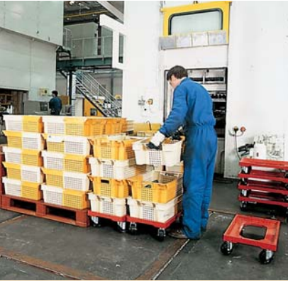
Automotive supplier: dollies allow stable stacking of containers (ref. 91005).