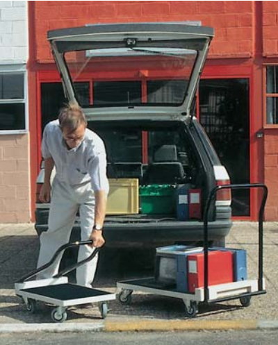
Service industry: for moving a variety of loads (ref. 97032 and 97042)