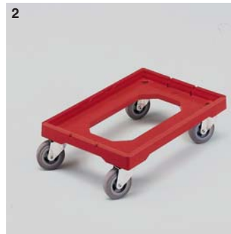
2 Ref. 91011 minimum order item Rubber wheels on galvanised mountings Dim.: L 604 X w 402 X h 162 mm Dim.: L 23.8 X w 15.8 X h 6.4" four swivel castors, Ø 100 mm/4" loading: 250 kg/550 lbs Wt: 4.00 kg/8.8 lbs. Colour: red.