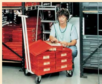
Pharmaceutical industry: manoeuvrability in cramped areas. (ref: 910A8).